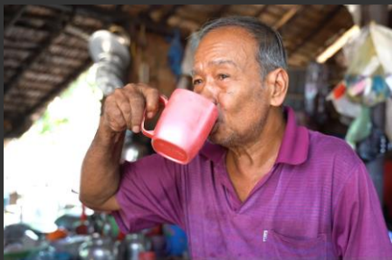
Cleaner, Safer Water in Cambodia

Through the online registration process, participants are prompted to contribute to one of the selected projects* certified by renowned international bodies like the UNFCCC, Gold Standard, or Verified Carbon Standard. The projects selected align with the IUCN Programme and Regions, prioritising those led by Members.