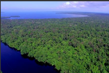
Conservation Coast in Guatemala