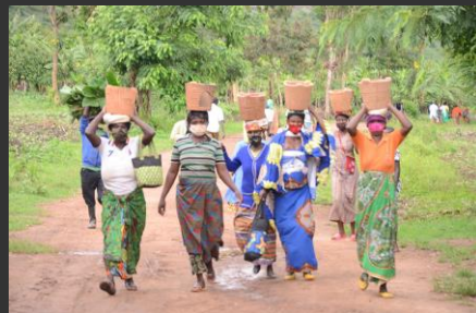
Improved Cookstoves for conservation of Ibanda-Makera Gallery Forest in Rwanda