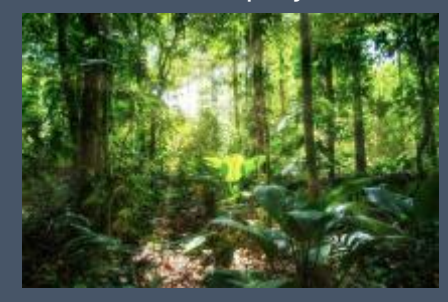
Bauminvest mixed reforestation in Costa <u>Rica</u>